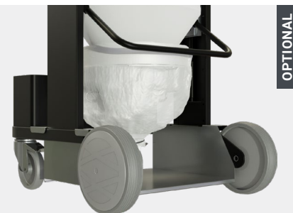
LONGOPAC CONTINUOUS BAG UNLOADING SYSTEM