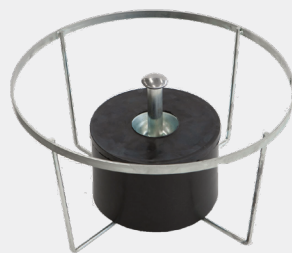
CONE FLOAT *