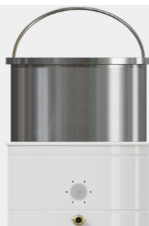
CHIP SEPARATOR BASKET