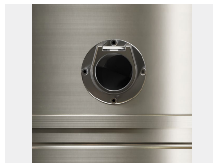
CENTRAL INLET ENTRANCE