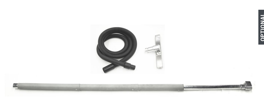
OVEN KIT : Extension with quick connection - Oven brush - Supercalor flexible hose PRO (available in 3m or 5m)