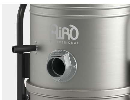
STAINLESS STEEL IN FRAME BODY