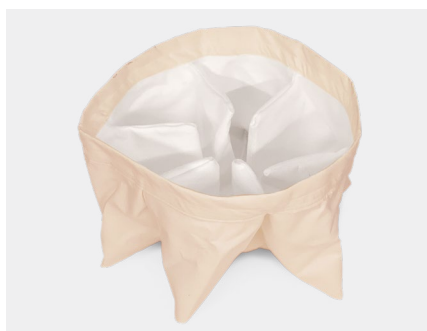
NOMEX FILTER - HIGH TEMPERATURE