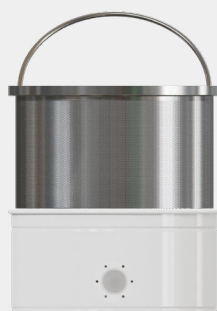
CHIP SEPARATOR BASKET