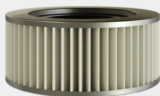
HEPA SECONDARY FILTER