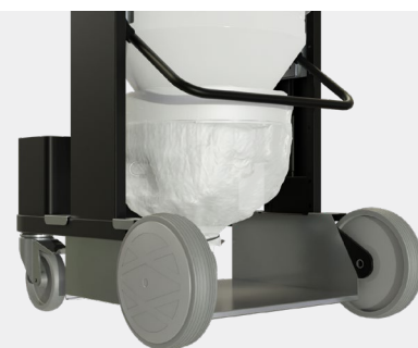
LONGOPAC CONTINUOUS BAG UNLOADING SYSTEM